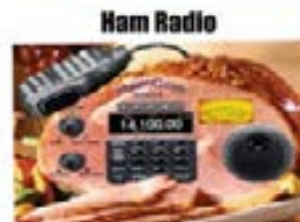
Know The Difference