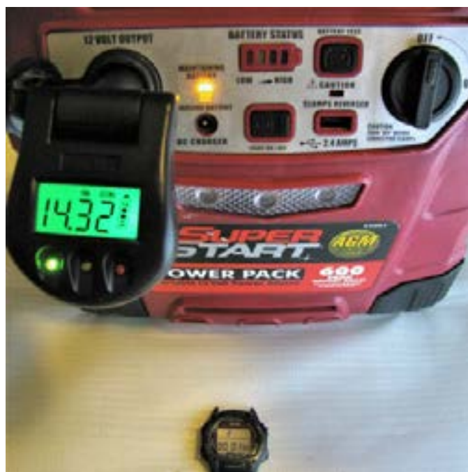
Figure 4: Voltmeter showing maintenance voltage

The bottom line is, verify (measure) your charger’s voltage if you will leave it powered indefinitely. It’s easy to check battery voltage with a multimeter, or with a voltmeter that plugs into the 12V outlet (see Figure 4). If the voltage appears acceptable, check it again a few hours later and a day later. If not, unplug it for storage.