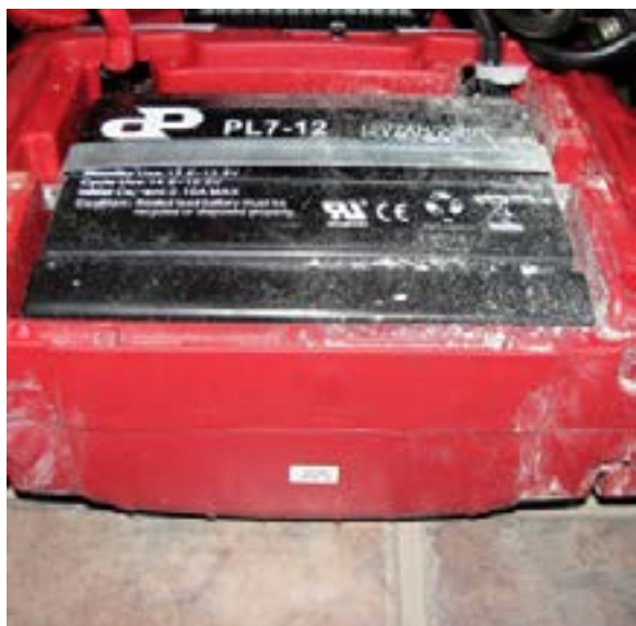
Figure 3: What does not belong?

In practice, the two-stage charger in this unit falls short of ideal. The first stage illuminated the “charging battery” LED and charged until the battery voltage rose to 14.4V. The second stage illuminated the “maintaining battery” LED, let the battery voltage drift down to 13.2V, then charged more slowly. During an eight-hour span, the stage-2 voltage rose to and settled at 14.4V, well above the recommended Standby Use range. Continued charging at 14.4V will overcharge and damage the battery. There is evidence this occurred.