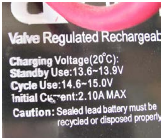
Figure 2: Battery charging specifications.

In practice, the two-stage charger in this unit falls short of ideal. The first stage illuminated the “charging battery” LED and charged until the battery voltage rose to 14.4V. The second stage illuminated the “maintaining battery” LED, let the battery voltage drift down to 13.2V, then charged more slowly. During an eight-hour span, the stage-2 voltage rose to and settled at 14.4V, well above the recommended Standby Use range. Continued charging at 14.4V will overcharge and damage the battery. There is evidence this occurred.