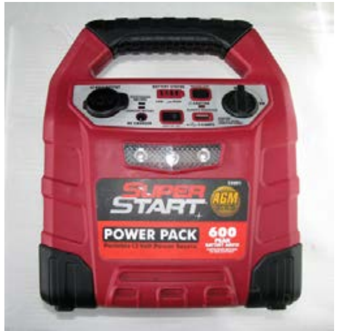
Figure 1: Jump-start battery pack.

It's wise to check the final charging voltage of any battery charger left connected indefinitely lest it overcharge the battery. Here's a case in point for a specific 12V battery.